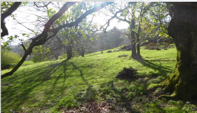
Near Glenthorne: looking towards Allen Bank, where Wordsworth once lived.