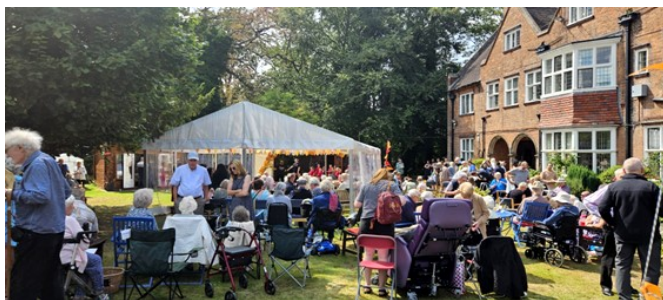
The Woodlands 80 th Anniversary garden party August 2025

The Paddock is also located within the grounds; here there are 25 Sheltered Housing flats.