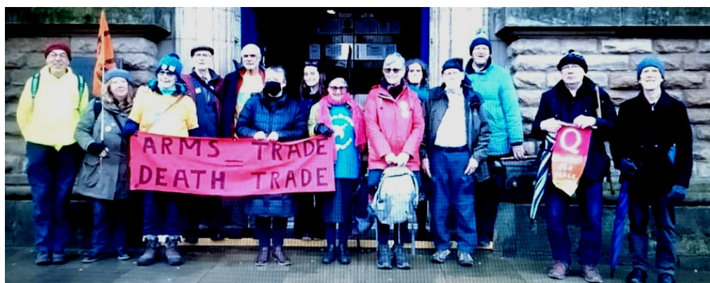
Quakers with the arrested protestors, Wolverhampton Magistrates Court, December 12

MOTIVATED BY CONCERNS TO CHALLENGE THE ARMS TRADE AND ITS ASSOCIATED CLIMATE DAMAGE